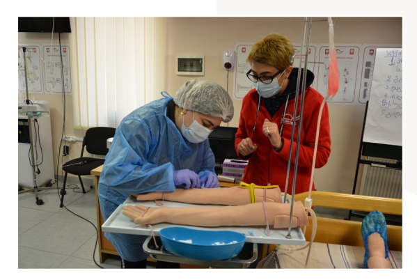
At the Caritas Education and Training Centre, nursing students receive practical training in geriatric care as part of their training, © Caritas