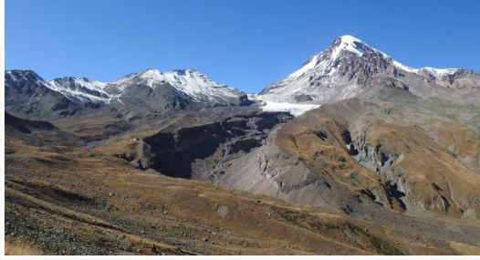
Kazbegi National Park