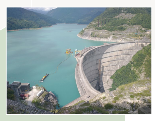
Enguri Dam

Other topics at the centre of the funding are health, biodiversity, urban-rural systems, and socio-ecological research.