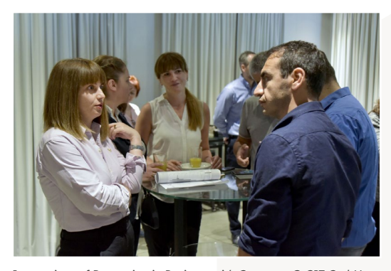
Impressions of Partnering in Business with Germany, © GIZ GmbH