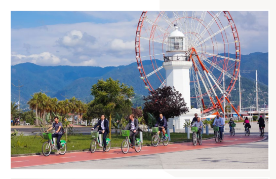
Cycling in Batumi - sustainable urban development, © GIZ/Mobility4Cities

Innovative systems for efficient traffic management, the upgrading of local public transport and the expansion of the cycle and pedestrian network are the elements for promoting climate and environmentally friendly urban mobility in Tbilisi and Batumi. The aim is to reduce global greenhouse gas emissions and improve air quality and living conditions for the urban population.