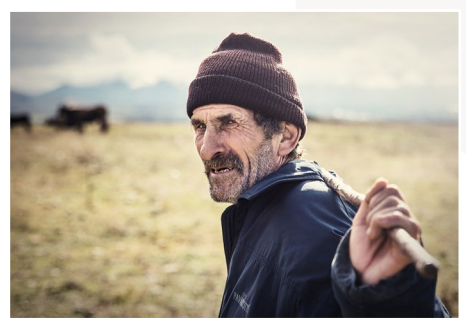
Shepherd with his herd of cows and sheep