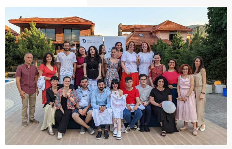
Seminar for young liberals, organised by the Free Democrats Party in Mtskheta