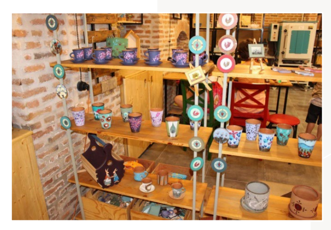
Micro-project to create jobs for people with disabilities in the social enterprise "Babale"

The Embassy directly supports Georgian non-profit organisations to alleviate acute emergencies and to sustainably improve the living conditions of the poorest segments of the population.