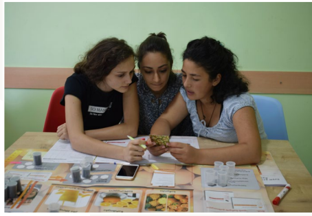
young people playing micro business games at the adult education centre in Leliani, Kakheti