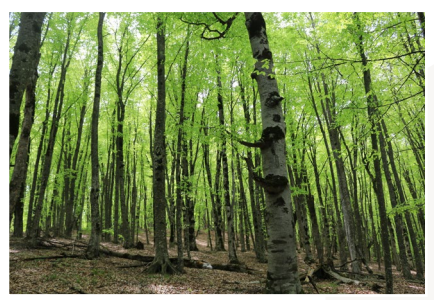
Forest sector reform and sustainable climate-adapted forest management

The additional networking of protected areas through the establishment of corridors for genetic exchange and the migration of species will strengthen biodiversity conservation inside and outside the protected areas.