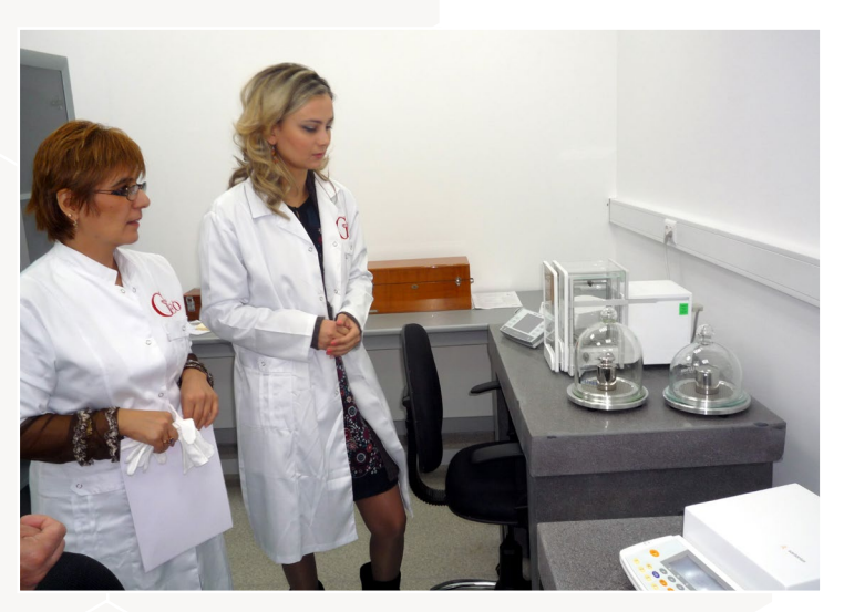
Employees of the National Metrology Institute in the mass laboratory, © Georgian National Agency for Standards and Metrology (GEOSTM)